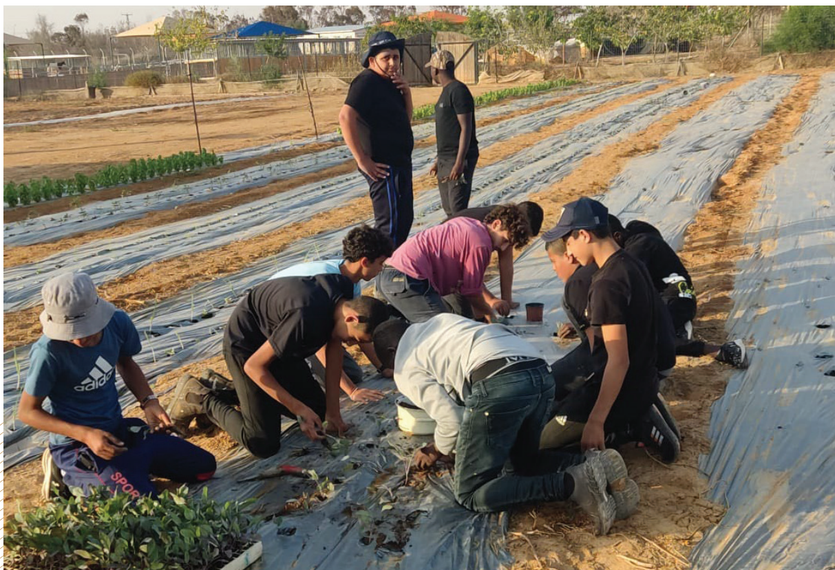
Bedouin students at Neve Midbar Village during agricultural activity.

Pupils can also enjoy after-school enrichment activities in the boarding school. These include social activities given by social instructors and Year of Service volunteers, individual booster lessons and leisure activities such as physical training, swimming, navigation, soccer, ceramics, etc. This allows students to develop in a holistic framework that accompanies them 24/7. Here they receive full support from a dedicated team of instructors, as well as a platform that helps them develop broad life skills in a large number of fields. They will also be exposed to art, music and other subjects.