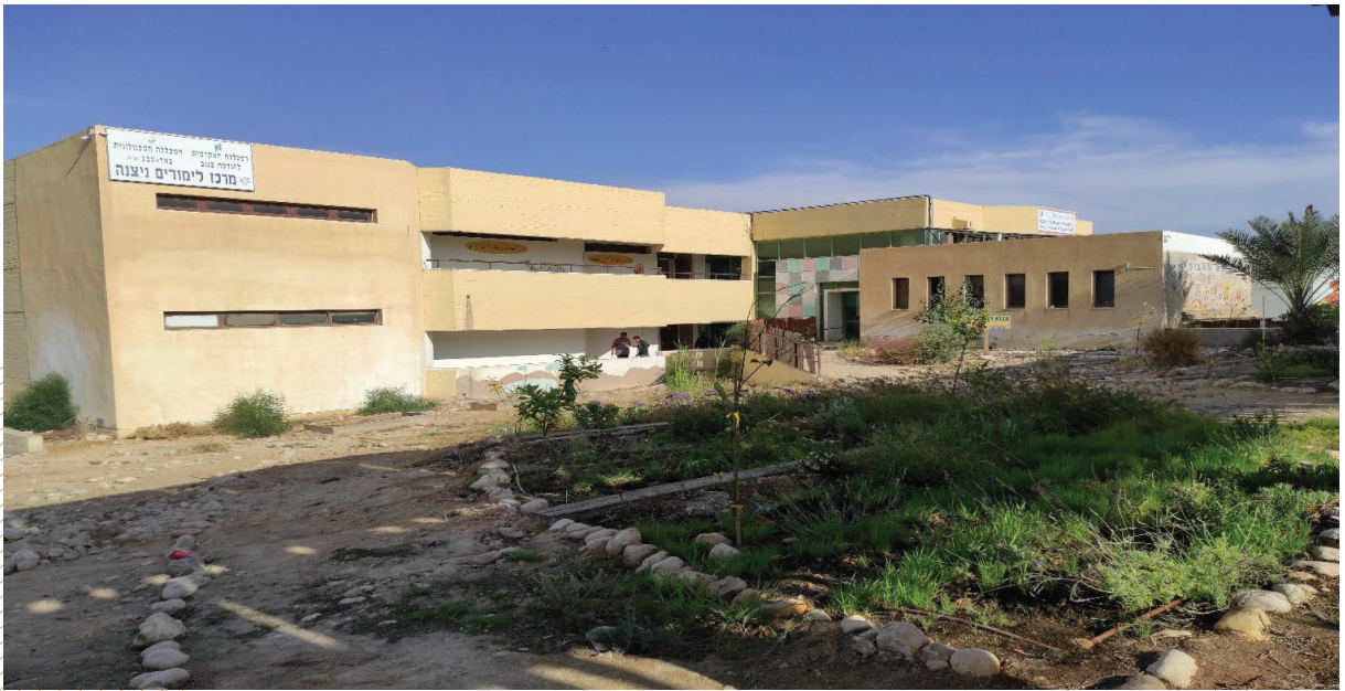
The Neve Midbar Agricultural and Environmental School for Bedouin Youth, as it appears today.

The Neve Midbar Agricultural and Environmental School for Bedouin Youth was established in Nitzana at the start of the 2015-16 school year in cooperation with the Bedouin community. Its student body is comprised of 140 boys from all over the Negev -- from different tribes, permanent villages, and unrecognized villages – the school prepares them for full matriculation.