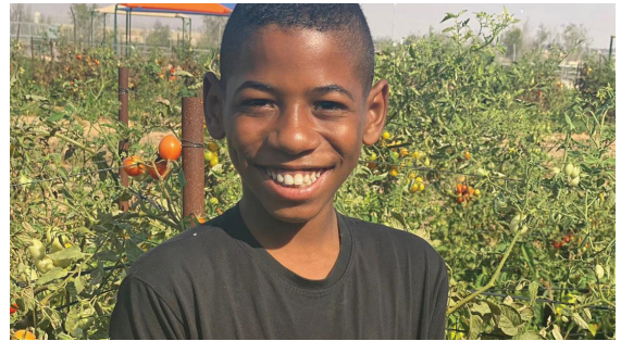
Bedouin students at Neve Midbar Village.

Enhancing the Bedouin community's standard of living, which includes providing young Bedouins with access to opportunities, is essential for advancing and developing the Negev for all its residents and for the State of Israel in general. By strengthening the educational system and increasing higher educational opportunities, this process can begin.