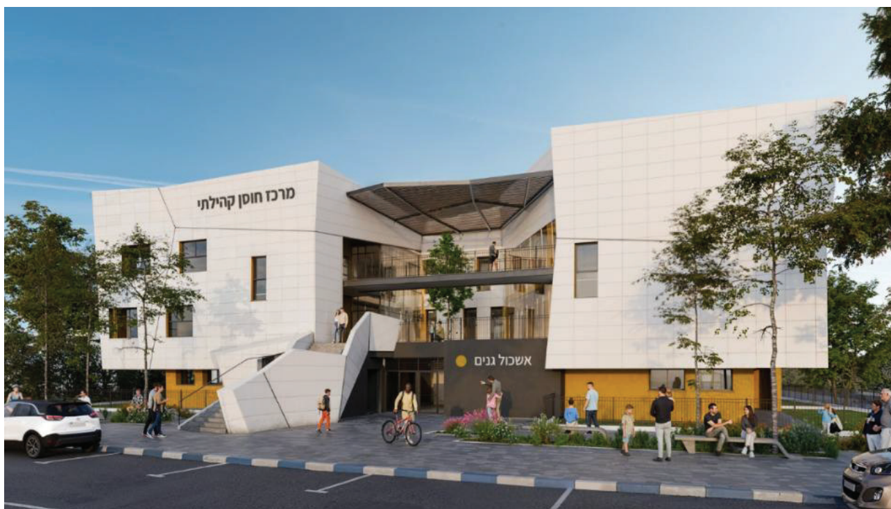
Simulation of building exterior

One of the key initiatives to strengthen the residents of Sderot is the establishment of a new Resilience Centre.