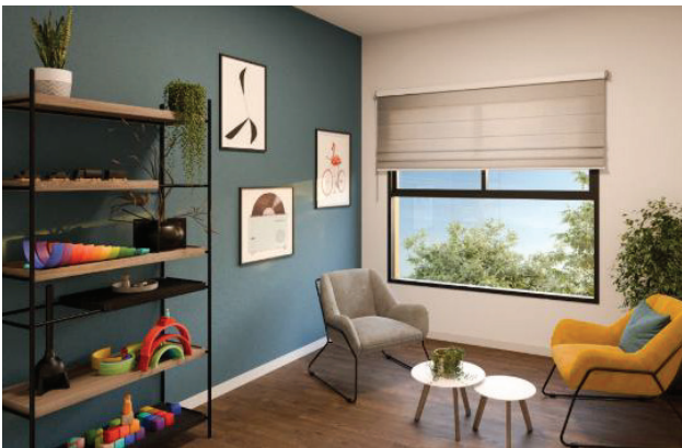
Simulation of individual therapy room