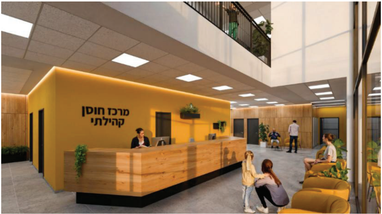
Simulation of reception area