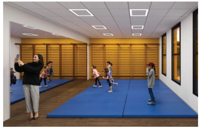
Simulation of movement therapy room

Your generous partnership with Keren Hayesod will help restore and bolster the sense of security, resilience, and community for the residents of Sderot, reinforce the south of Israel, and strengthen the State of Israel.